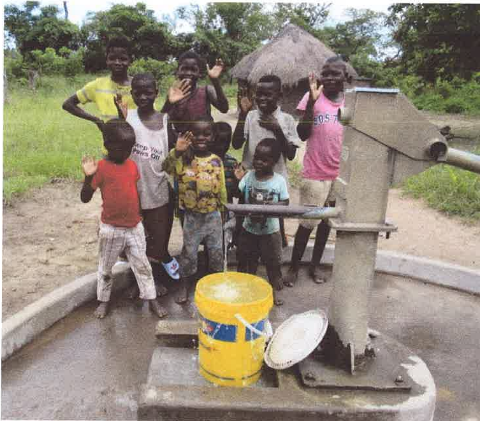
Chinete Village, Macate District, Mozambique