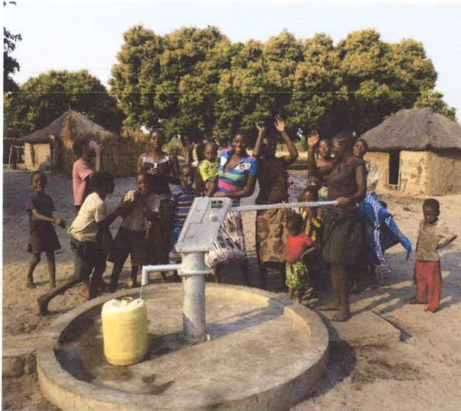
Maseka Village, Mongu District, Zambia.